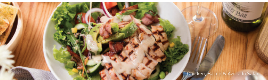
Chicken, Bacon & Avocado Salad