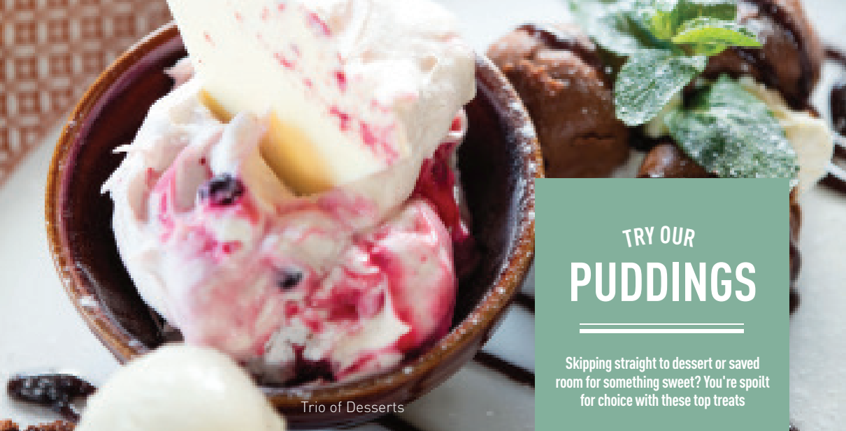
Trio of Desserts