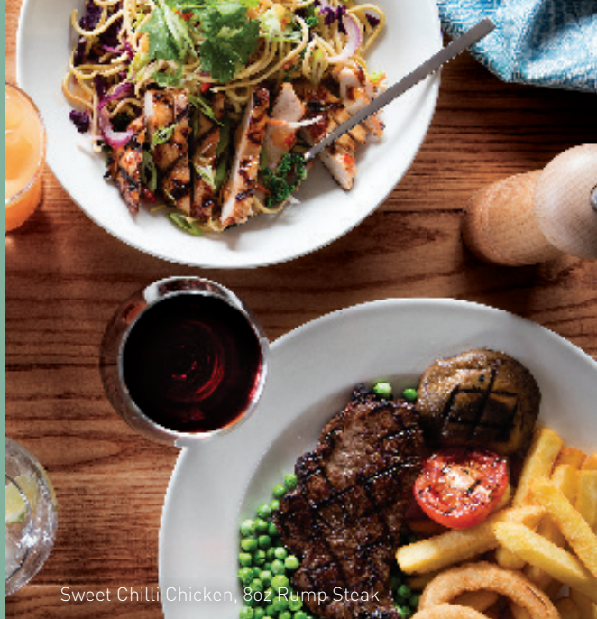
Sweet Chilli Chicken, 8oz Rump Steak