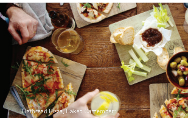
Flatbread Pizza, Baked Camembert

CHILDREN'S MENU Ask our team for details