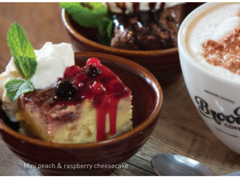
Mini peach & raspberry cheesecake

TREAT YOURSELF MINI PUDS WITH COFFEE OR TEA £4.79 MINI BROWNIE MINI ETON MESS SUNDAE MINI PEACH & RASPBERRY CHEESECAKE