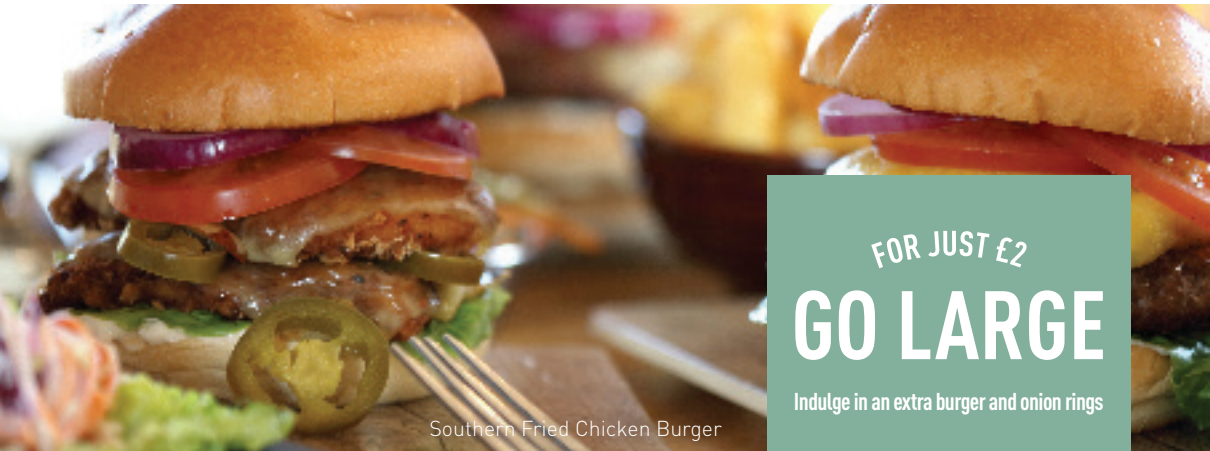
Southern Fried Chicken Burger

All our burgers are served in a toasted brioche bun with crisp lettuce, red onion, tomato, mayonnaise, seasoned chips and house slaw on the side