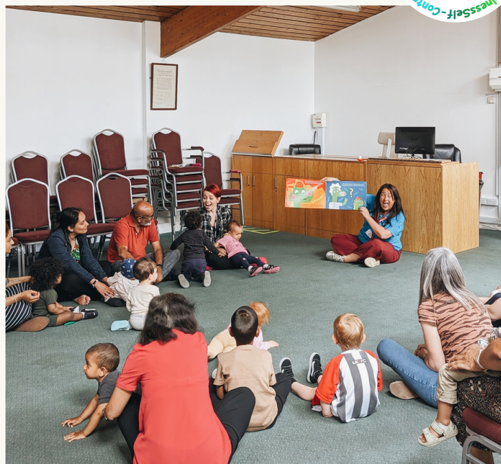
Storytime lead by Oral Health Team

Each of our venues has welcomed new families and it is always such a joy when we see new friendships being formed and the children learning new things. Thank you for offering the gift of friendship to others – we love the diversity of our groups and aware that this sometimes brings challenges. I know we had a couple of biting incidents in the very hot weather, and we were so pleased how people dealt with these – kindness and understanding goes a long way. You may or not be aware that we run 11 sessions each week in 10 different venues and that every group is completely different to any other – this depends on the venue, the team and attendees. Large or small, we hope everyone finds something they enjoy. We even have a monthly Dad's Zone just for dads and other male carers. Thank you to everyone who took part in our survey – we value your feedback and even though we can't take on board every suggestion, we can make tweaks here and there.