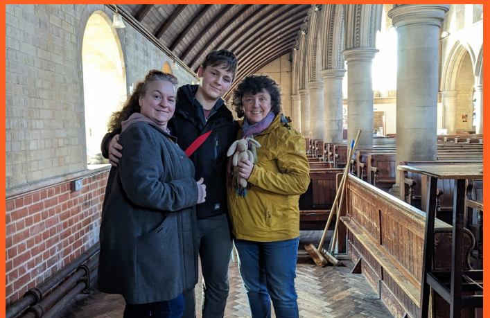
Farewell to St Michael's