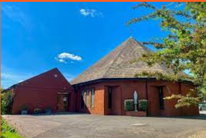
St Patrick's Church, Neasden

We continue to receive toy donations from the community and these help in so many ways. So glad we can use these in our sessions and anything we can't use we donate to charity