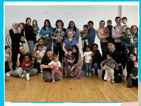
(This photo shows some of the families at Chalkhill Community Centre, a group funded by Children in Need)