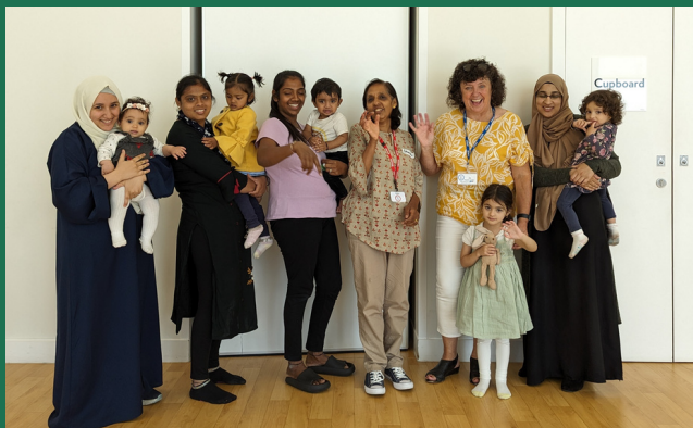
First Day @ the Grand Union