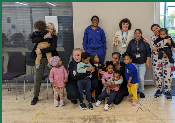
First Day @ The Bridgestone Arena

We opened two new groups this term. One at Grand Union Community Hub in Alperton (meeting on Thursdays 9.30-11am) and another at Bridgestone Arena in Stonebridge (meeting on Wednesdays 1.15-2.45pm).